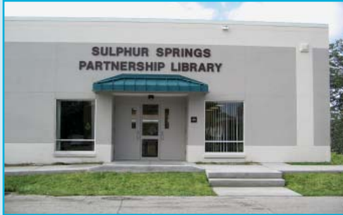
Norma and Joseph Robinson Partnership Library @ Sulphur Springs

In February 2010, the third cooperative venture with the Hillsborough County School District opened in the expanded School Media Center of the Sulphur Springs Elementary School.