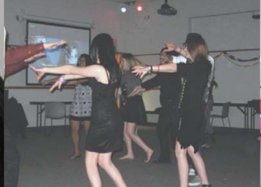
New Glee Ball