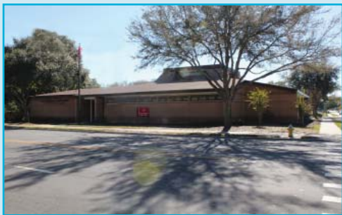
C. Blythe Andrews, Jr. Public Library

In August 2010, the Library was renamed the Norma and Joseph Robinson Partnership Library @ Sulphur Springs.