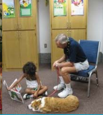
PAWS For Reading