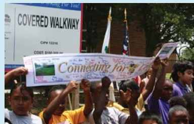
Groundbreaking for Walkway

Construction was completed in September 2009 on a covered walkway connecting Booker T. Washington Elementary School and Robert W. Saunders Sr. Library to provide a safer route for the children.