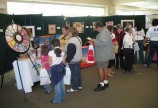
Knowledge is POWER