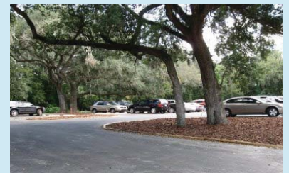
Riverview Branch Library

In September 2008, the parking lot at Riverview Branch Library was expanded and re-landscaped.