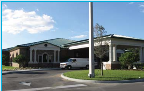
Seffner-Mango Branch Library

The new Seffner-Mango Branch Library opened in January 2009 with a collection of 75,000 items. The new 15,000-square-foot facility replaces a 6,000-square-foot storefront and houses space for meeting rooms, a children's area, study rooms and a science room for students of all ages.