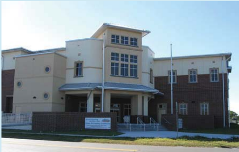
Town 'N Country Regional Library

In December 2008, the new 30,000-square-foot Town 'N Country Regional Library opened with a revitalized collection of materials, children's wing, computer lab, teen room and many meeting rooms. Located in the Town 'N Country Commons, the library shares the complex with a Hillsborough County Senior Center and Head Start facility, and will soon include a redesigned neighborhood park.