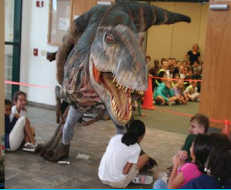
Walking with Dinosaurs