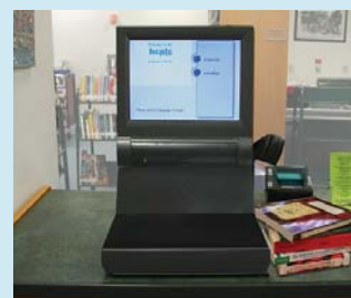
Self Check Out

Eleven branches currently offer self check out in which patrons are able to check out library materials without staff assistance.