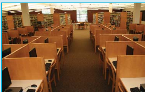
North Tampa Branch Library

The North Tampa Branch Library closed in April 2008 in preparation for a new facility to be built at the existing location. The new library opened in September 2009 and includes a large community room, teen room, separate children's department, computer lab, and a bookstore operated by the Friends of the North Tampa Branch Library.