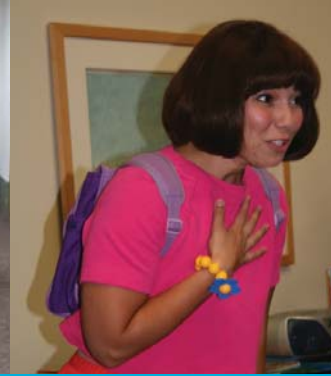
Dora the Explorer